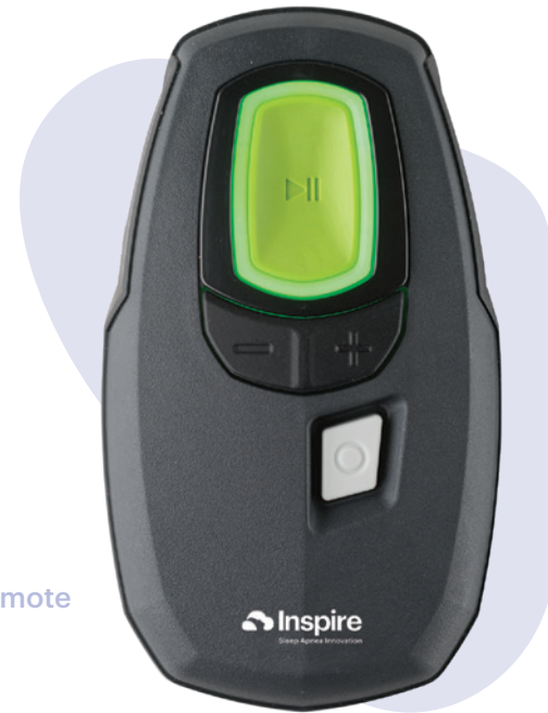
Inspire Sleep Remote

Inspire works inside your body while you sleep. It's a small device placed during a same-day, outpatient procedure. When you're ready for bed, simply click the remote to turn Inspire on. While you sleep, Inspire opens your airway, allowing you to breathe normally and sleep peacefully.